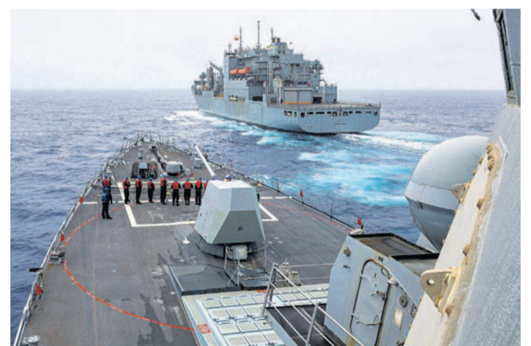
In this photo released by the U.S. Navy The Arleigh Burke-class guided-missile destroyer USS John Finn (DDG 113) prepares to come alongside Lewis and Clark-class dry cargo ship Cesar Chavez (T-AKE-14) in the East China Sea, on Jan. 21, 2024.

China agreed to resume military contacts with the U.S. at a meeting last November between Presidents Joe Biden and Xi Jinping in California. In part, the argument for doing so was to be able to manage an unintentional collision or other incident that could happen as both sides hold drills and patrol the waters in regional hotspots includ-